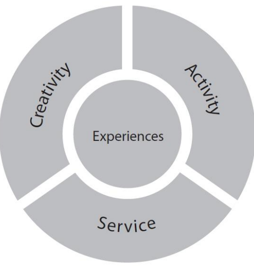
Figure 1: CAS experiences

A CAS experience is a specific event in which the student engages with one or more of the three CAS strands.